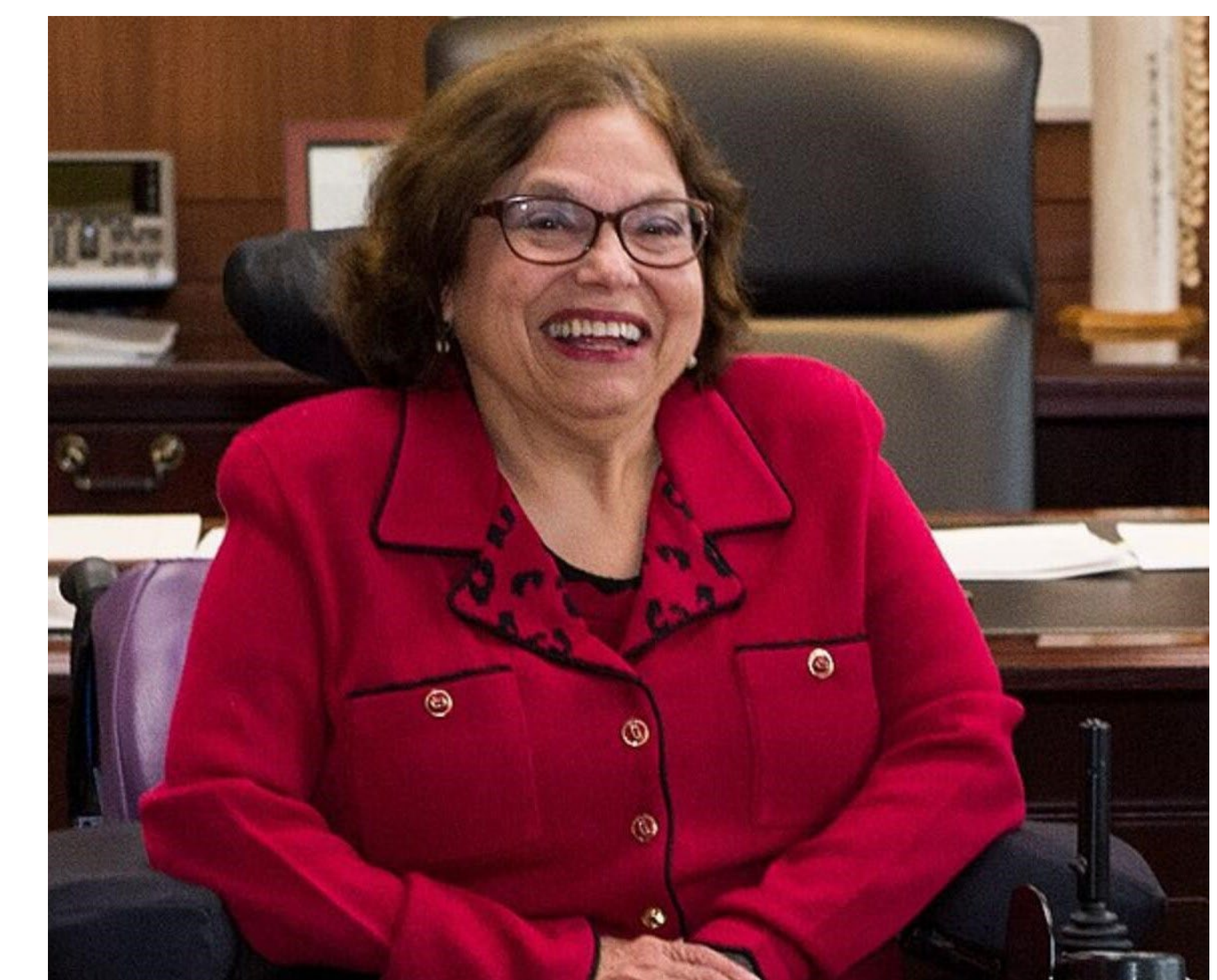
Judy Heumann