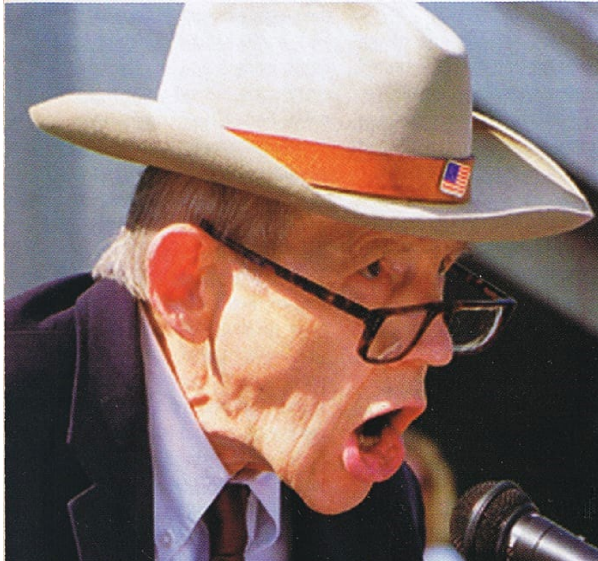
Justin Dart Jr., a polio survivor, was instrumental in the passage of the American with Disabilities Act and the Patient's Bill Of Rights.